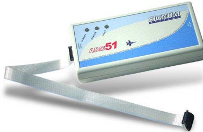
Figure 2: Signum ADM51 Emulator Pod

Note: Since meters are sometimes tested with live voltages, isolation of the emulator is strongly recommended. USB isolators are available from various vendors. For example, the UISOHUB4 or UEF10M are available at B&B Electronics ( www.bb-elec.com , or http://www.bb-europe.com/ ).