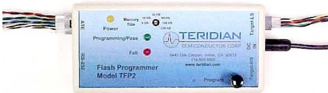
Figure 4: Teridian TFP-2 Flash Programmer

The Signum ADM51 can serve as a programmer for prototyping and small quantities. For programming production quantities, Teridian offers the TFP2 Flash Programming Module (P/N 80515-FPBM-TFP2), which is a stand-alone programmer that can be operated manually or in an ATE environment (see Figure 4).