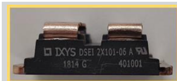
Figure 1: INKJET marked SOT-227B (old)

DESCRIPTION OF THE CHANGE: Starting from December 1 st , 2021 the marking of the SOT-227B package will change from inkjet marking to laser marking. A comparison can be seen in Figure 1 and 2 :