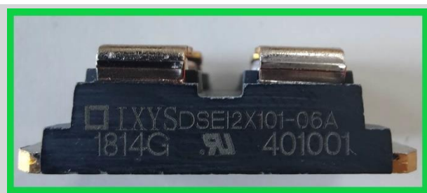
Figure 2: LASER marked SOT-227B (new)

A description of the marking is given in Figure 3