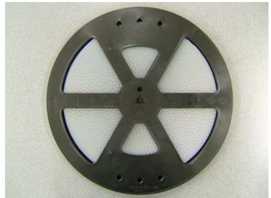
Photograph 2. Plastic Reel

2-2: A humidity resistant packaging specification has been added to the DF12 Series as a countermeasure against blistering. Humidity resistant packaging refers to connector embossed packaging where each reel is put into a polyethylene bag along with a desiccant (silica gel). (See the diagram on the next page.)