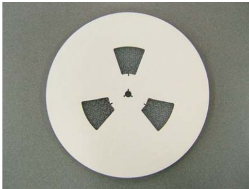
Photograph 1. Paper Reel

2-1: The form of packaging will be changed from paper reel to plastic reel.